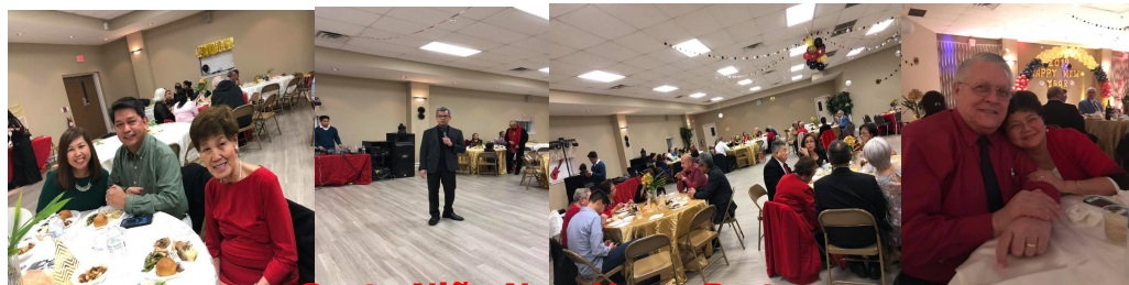
Santo Niño New Years Party