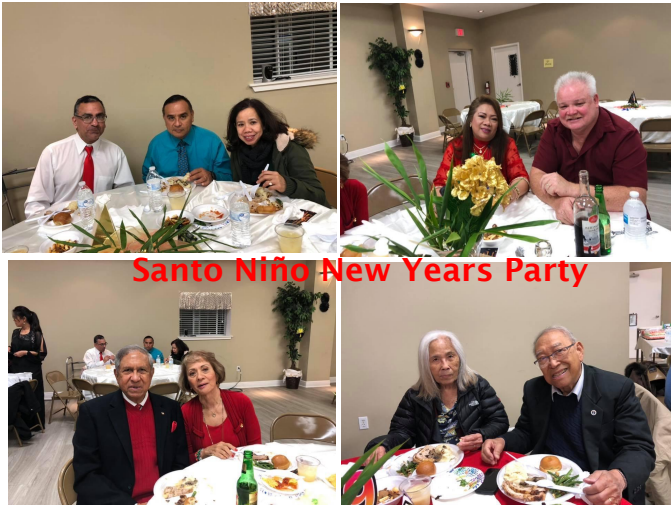
Santo Niño New Years Party

Major Degree (2nd & 3rd ) Saturday, January 19, 2019, from 7am to 1pm Hosted by St. Brigid Council 11596 Located at St. Brigid Catholic Church 6907 Kitchner Rd, San Antonio, TX 78240